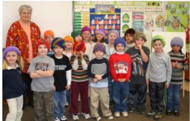
The two kindergarten classes at Rock Creek Elementary School in Erwin, Tennessee pose for a group photo wearing their new hats.

With temperatures already dipping into the 20s, it was time to deliver crocheted toboggan hats to elementary school children in nearby Erwin, Tennessee. Erwin is surrounded by the beautiful mountains of East Tennessee which at this time of year are clothed in their finest autumn colors.