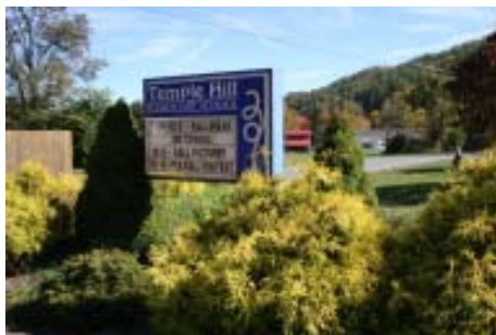
Students at Temple Hill Elementary School received hats this year.

storage cube, but the students begged to wear their hats so he told them if their heads were cold to put their hats on. Immediately, they donned their hats. When we left the school, one class was lined up in the hallway ready to go to lunch—all wearing their hats.