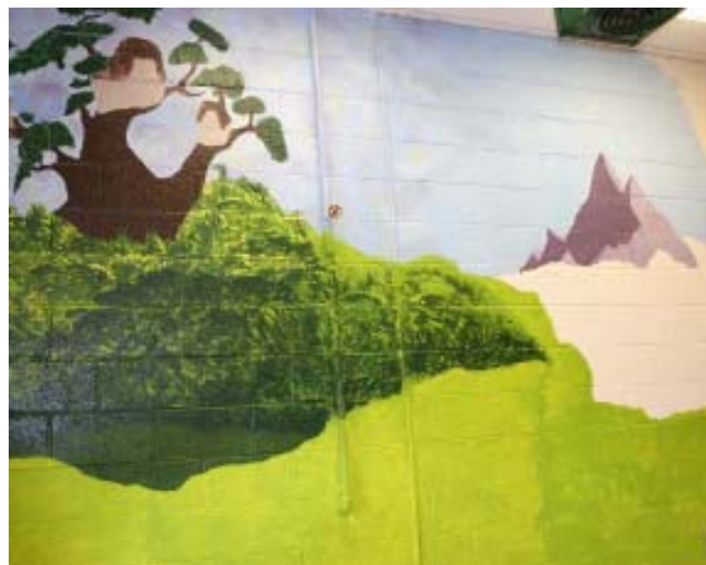
Wall mural painted by high school art students.