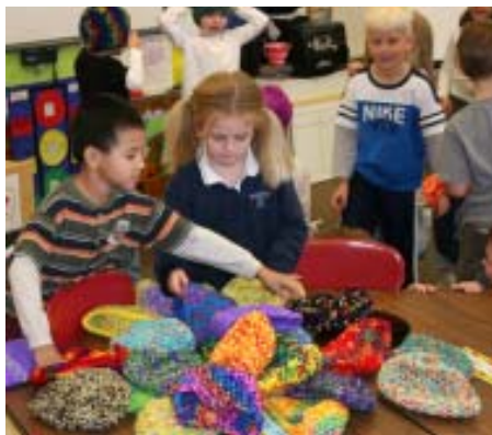
The children got to pick the hat that they wanted.